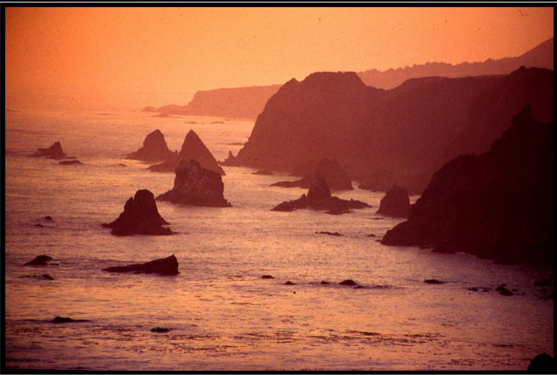
© Welcome to Northern Americas' West, where nature is still mightier than man. ☺ Californian Pacific Coastline along Highway No. 1 near Jenner (50 miles north of San Francisco) – August 2002